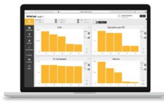
Data Capture Insight